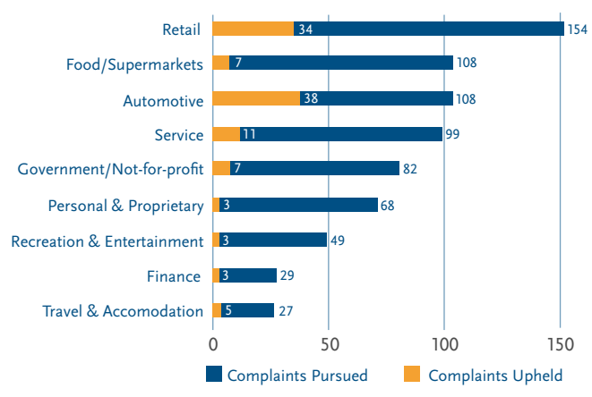
* Top nine of 16 categories

For the fourth consecutive year, retail advertising garnered the highest number of complaints (154). Next were complaints submitted about automotive advertising and food advertising (including advertising by food manufacturers, food retailers and restaurants) – each with 108 complaints. Complaints about advertising by service providers followed with 99 complaints.